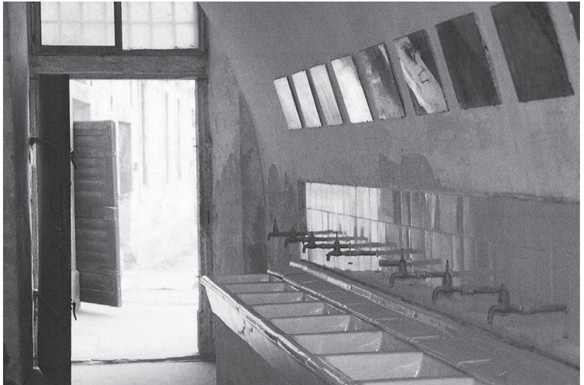
Faucets of Duplicity in Multiple Terezin, Czech Republic