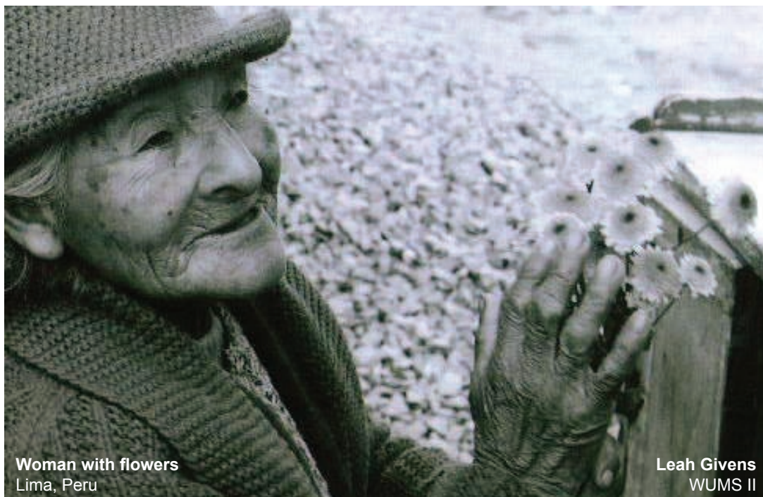
Woman with flowers Lima, Peru