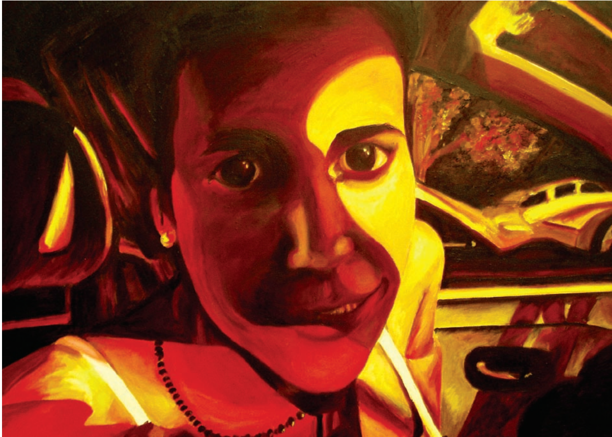
If you weren't already