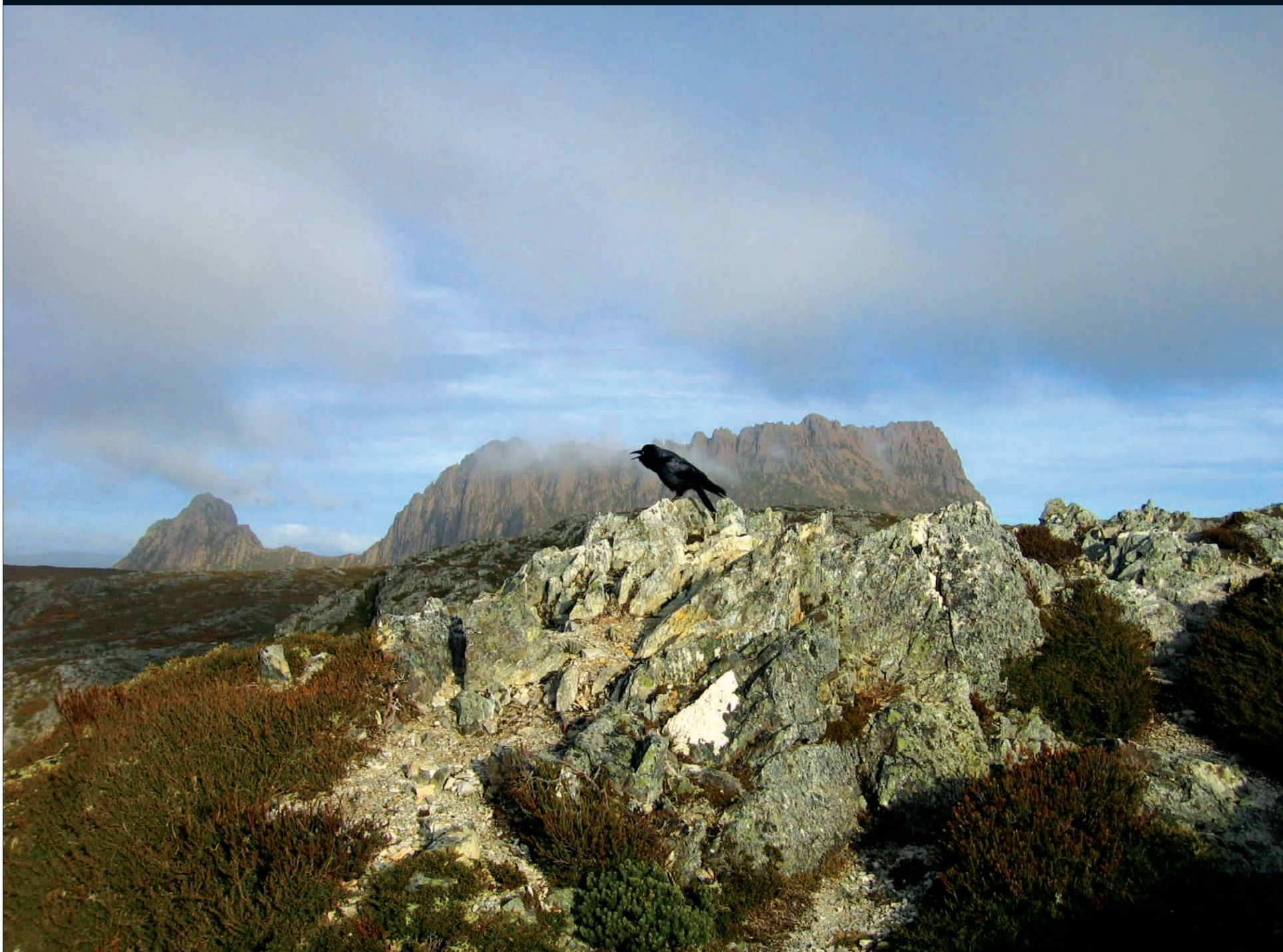
Crow in front of Cradle Mountain Tasmania, Australia