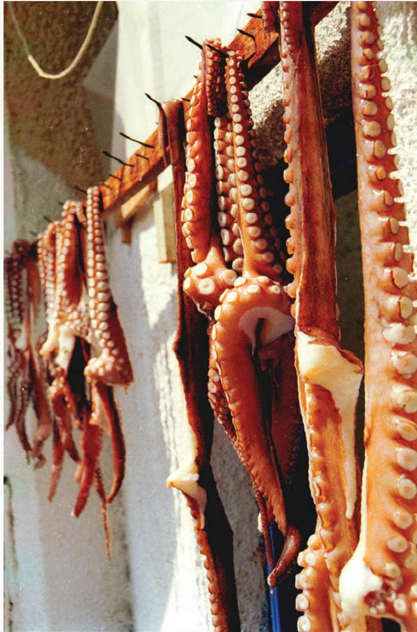
Octopus before dinner Skiathos, Greece