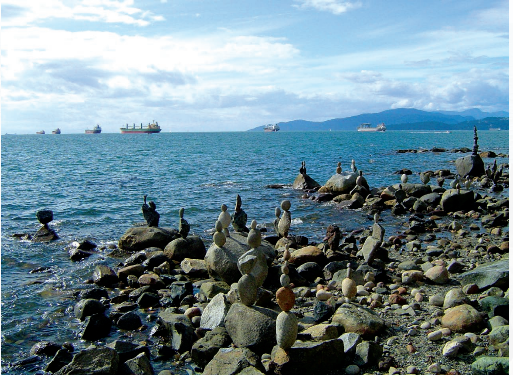
Works of Man and Nature Stanley Park, Vancouver, British Columbia